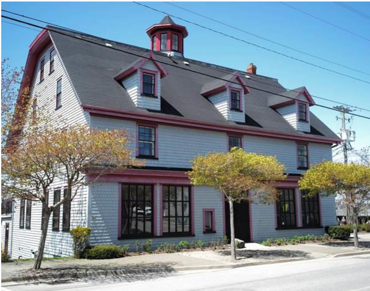
Killam Brothers Building in Yarmouth, site of the SNBR Cultural Heritage and Science Interpretive Centre.

We have acquired a 3 storey building on the Yarmouth waterfront which we are currently developing. This centre will showcase rural development across the region that leverages cultural, social and natural capital sustainably while contributing to the prosperity of local communities. The 10-year vision for the interpretive centre is a year-round, multi-use educational, research